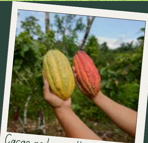
Cacao pods are the beginning of a chocolate bar.

Need more HP? Over 25% of modern medicine originates from rainforest plants.