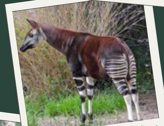
Not a glitch. This is the okapi from the Congo forest.