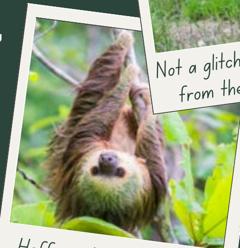
Hoffmann's two-toed sloth.